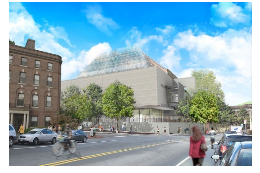
The Harvard Art Museums renovation and expansion project, rendering from Broadway and Prescott Street in Cambridge. (Courtesy Renzo Piano Building Workshop)

"The institutions in the greater Boston area are the foremost assets Boston has," says Mallis, pointing to Harvard, MIT and other area nonprofits that are international leaders. "I don't think that's been leveraged."