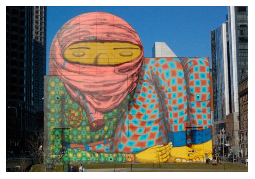
Brazilian graffiti stars Os Gêmeos painted a much-discussed mural as part of an Institute of Contemporary Art project along the Rose Kennedy Greenway at Dewey Square in July 2012.